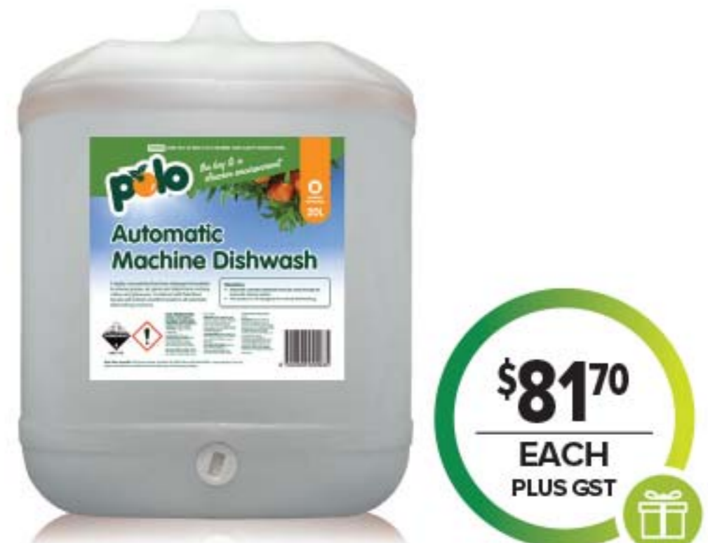
POLO CITRUS AUTOMATIC MACHINE DISHWASHING LIQUID