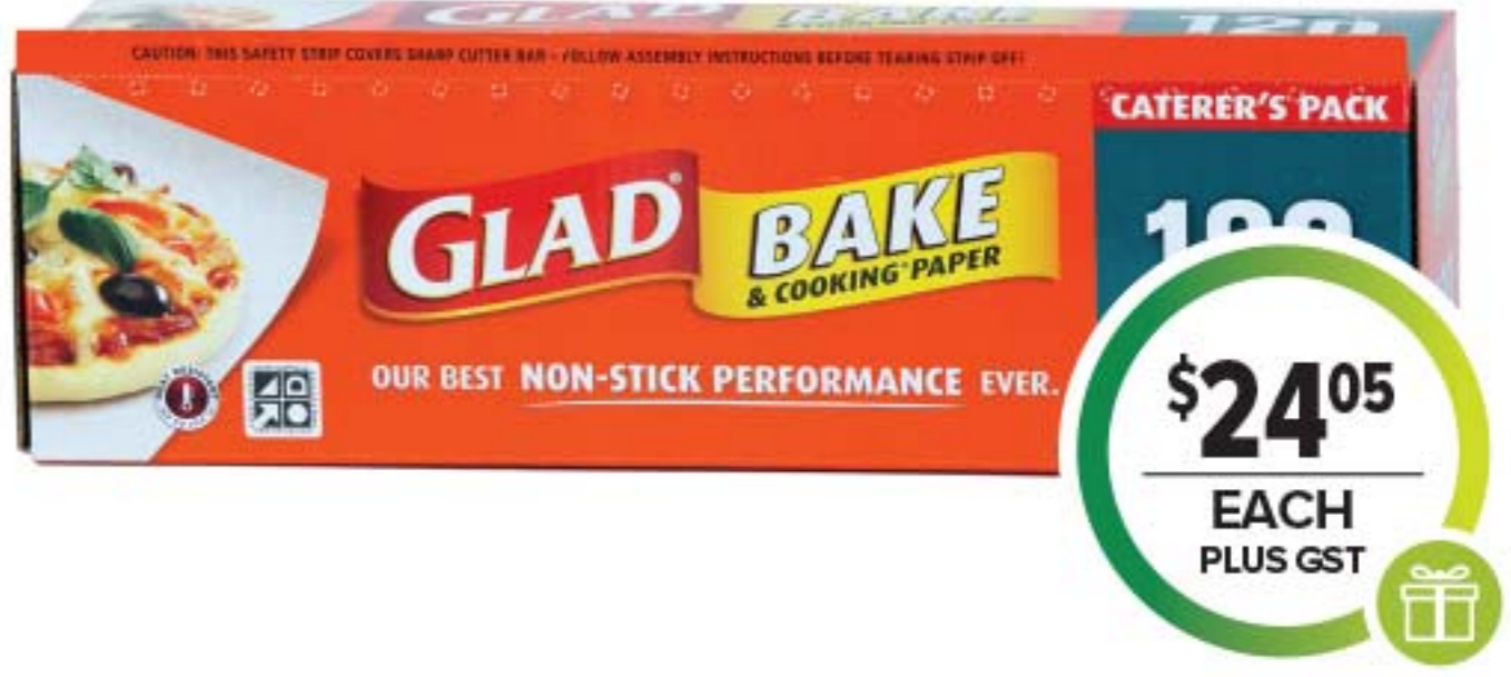
GLAD NON STICK BAKING PAPER (120M X 30CM)