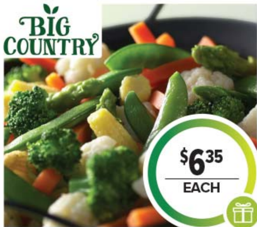
BIG COUNTRY FINDUS VEGETABLE MEDLEY 1KG