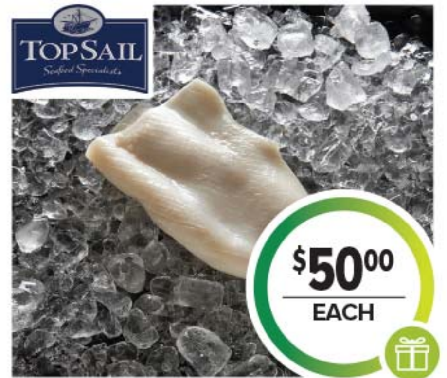
TOPSAIL U3 TENDERISED SQUID FILLET 5KG