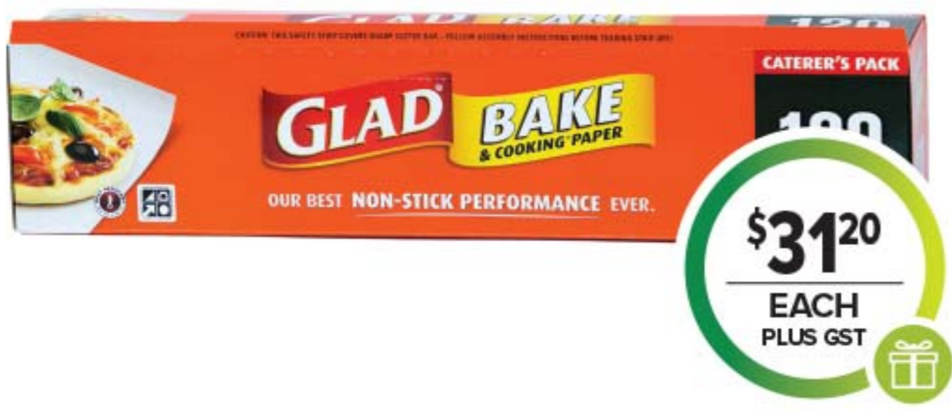
GLAD NON STICK BAKING PAPER (120M X 40.5CM)