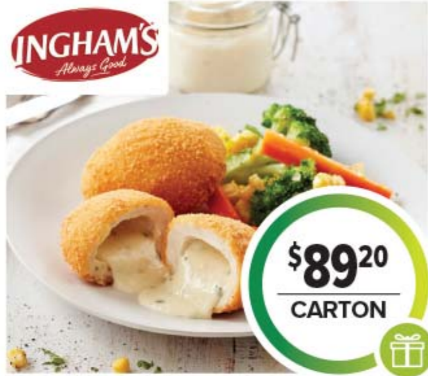
INGHAM'S ALFREDO FILLER