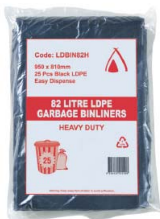
TAILORED PACKAGING BLACK HEAVY DUTY GARBAGE BIN LINERS 82LT X 25PK