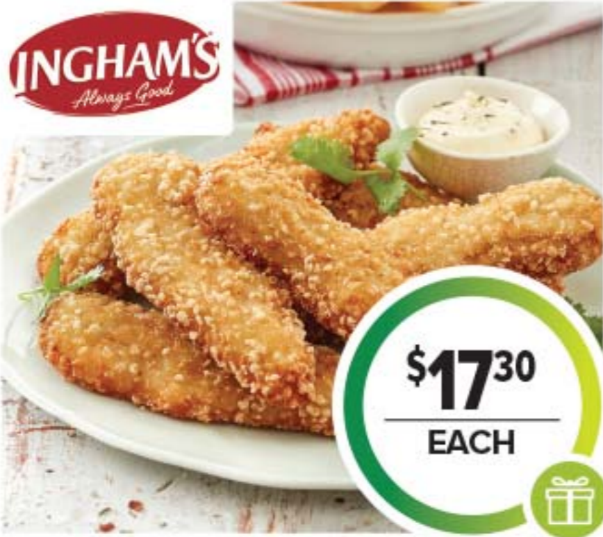
INGHAM'S SALT & VINEGAR TENDERS