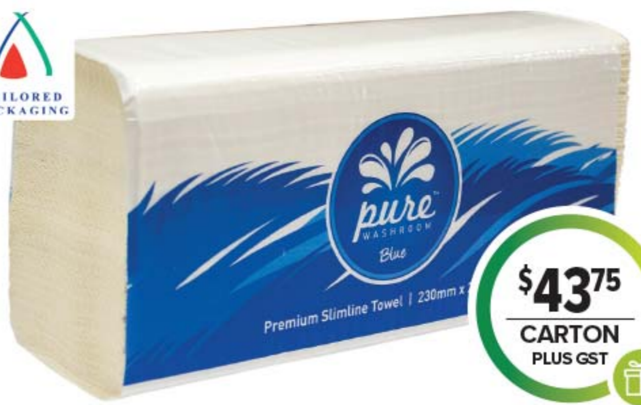
TAILORED PACKAGING HAND TOWEL SLIMLINE (230 X 230MM) 200 SHEET X 16