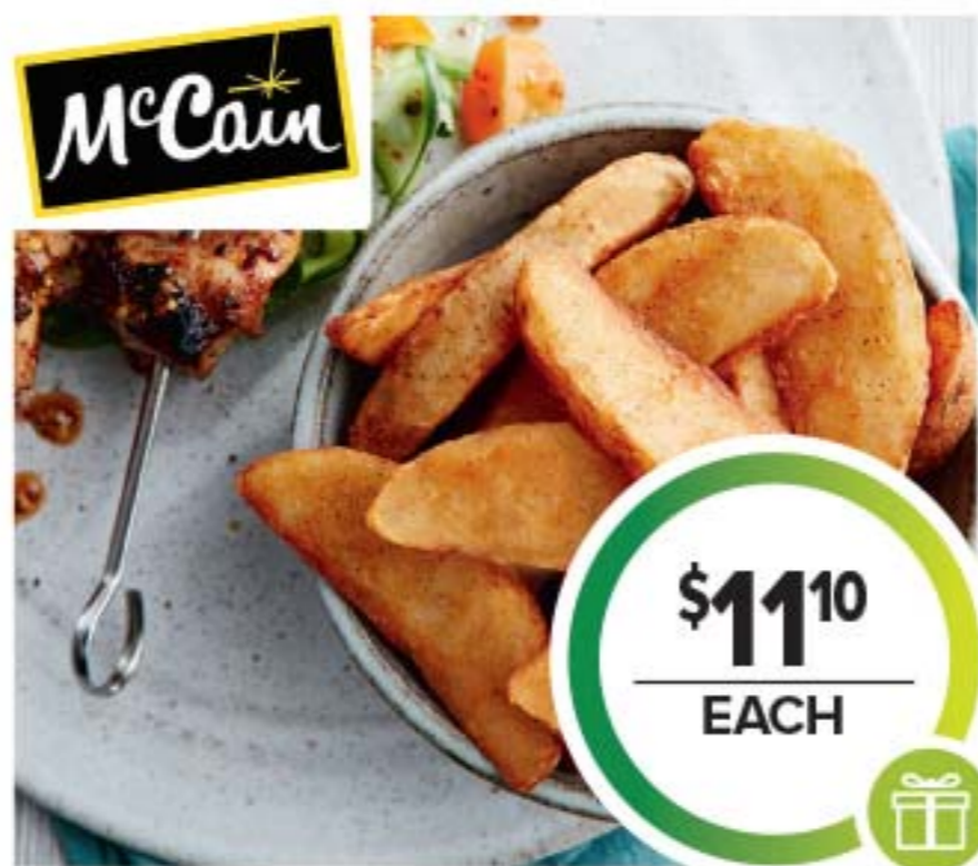
MCCAIN SEASONED WEDGES 2KG