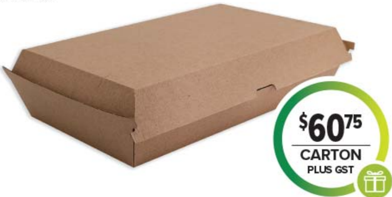
FUTURE FRIENDLY PAPER BOARD FAMILY BOX, (290 X 173 X 60MM) 25PK X 4