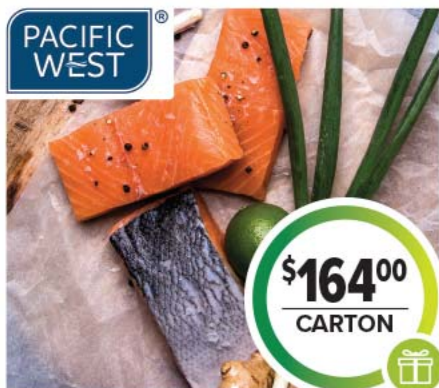
PACIFIC WEST SKIN ON SALMON PORTIONS 5KG