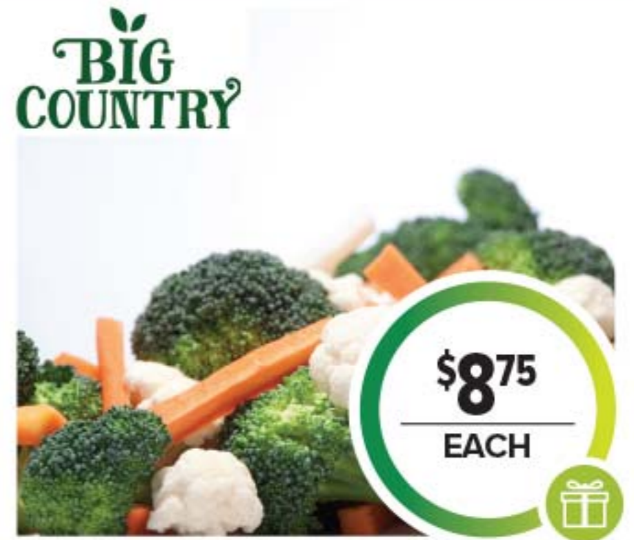
BIG COUNTRY CARROT, CAULIFLOWER & BROCCOLI 2KG