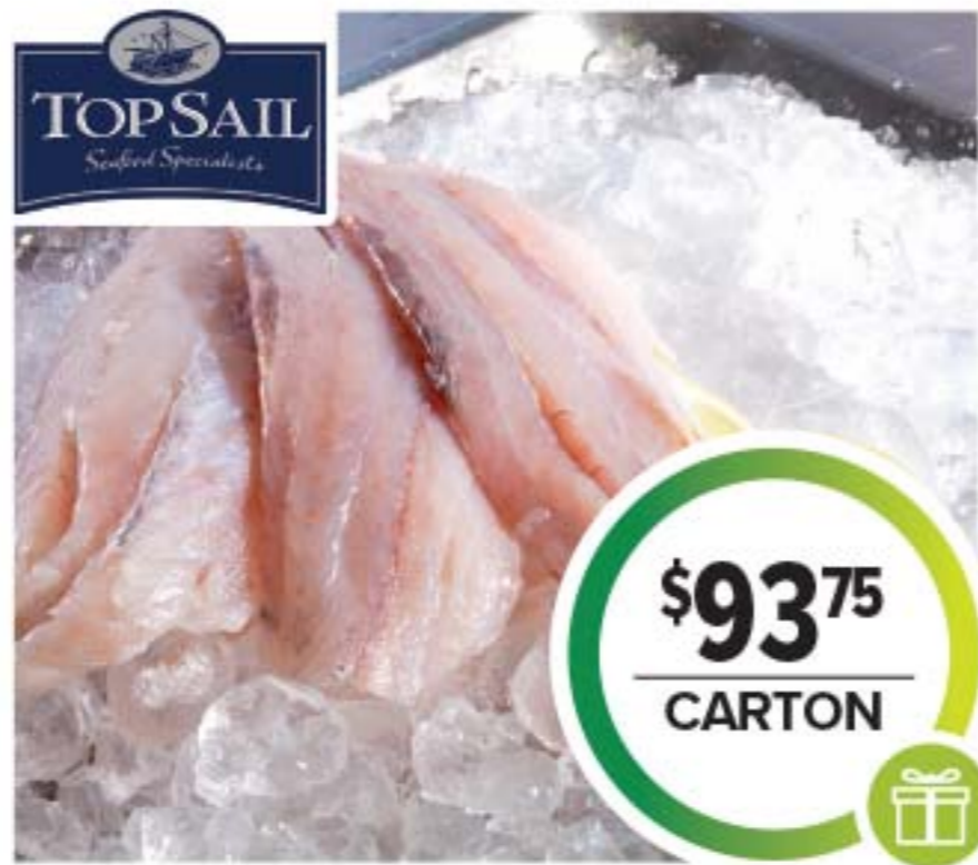
TOPSAIL FARMED SKINLESS BARRAMUNDI FILLET (200/300) 5KG