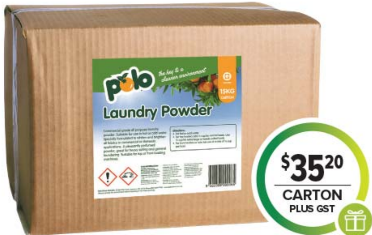
POLO CITRUS LAUNDRY POWDER 15KG