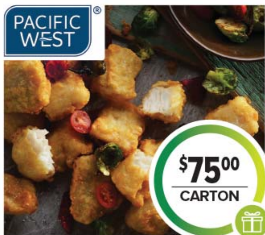
PACIFIC WEST TEMPURA FISH COCKTAILS 5KG