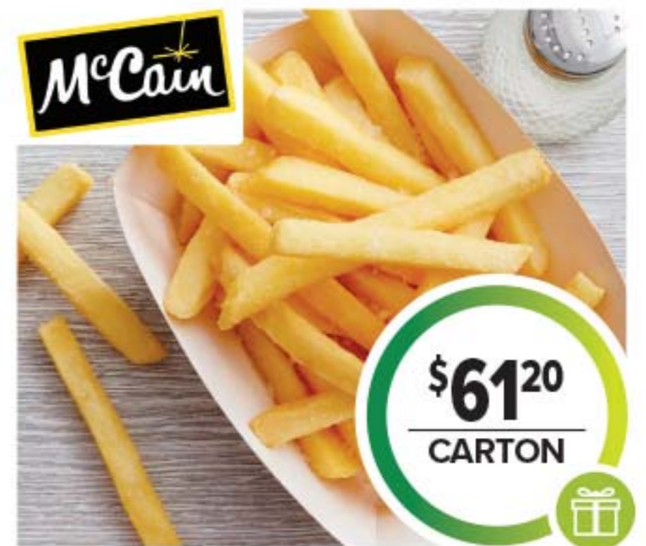
MCCAIN STAY CRISP FRIES 10MM 2KG